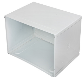
KSTSLV1: Optional Wall Sleeve (Sold Separately)