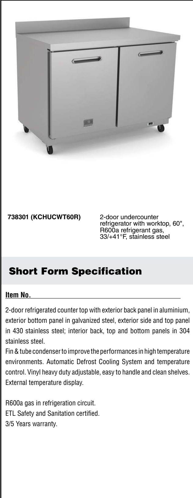
738301 (KCHUCWT60R) 2-door undercounter refrigerator with worktop, 60", R600a refrigerant gas, 33/+41°F, stainless steel