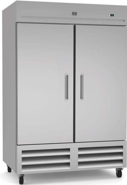
738245 (KCHRI54R2DFE) 2-door reach-in freezer, stainless steel, 49 cubic feet, R290 refrigerant gas, -9°F - Energy Star