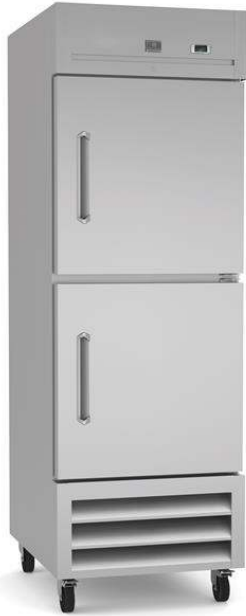
738280 (KCHRI27R2HDR) 2-half door reach-in refrigerator, stainless steel, 23 cubic feet, R290 refrigerant gas, +33/+41°F