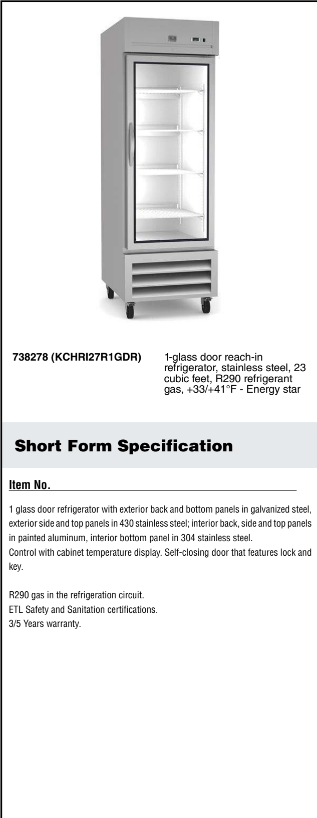
738278 (KCHRI27R1GDR) 1-glass door reach-in refrigerator, stainless steel, 23 cubic feet, R290 refrigerant gas, +33/+41°F - Energy star