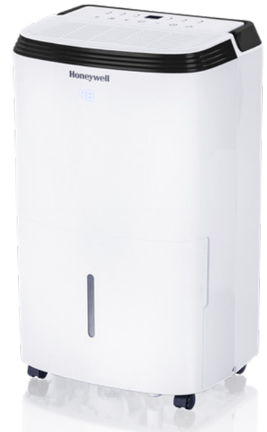
Product Dimensions (in): 12.4 (W) 15.7 (D) 25.4 (H) Net Weight: 41.1 lbs

What's more? The Washable Dust Filter helps reduce dust in the air, and is easily cleaned under a faucet - No replacement filters required.