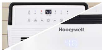
Versatile Digital Control with Mirage Display