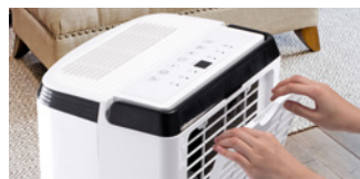
Washable Dust Filter and Filter Clean Alert