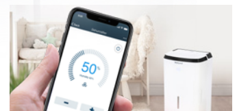
Amazon Alexa Voice Control