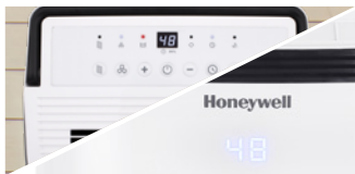
Versatile Digital Control with Mirage Display