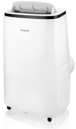
Product Dimensions (in): 18.9 (W) 15.4 (D) 30.7(H) Net Weight: Cooling: 70lbs / Heating: 70.71lbs

4-in-1 All-season appliance, this Portable AC with Heat Pump, Fan & Dehumidifier cools or heats a room up to 400-550 Sq. Ft. Automatic vertical wind motion helps distribute powerful cool/warm air evenly for fast & consistent cooling/heating.