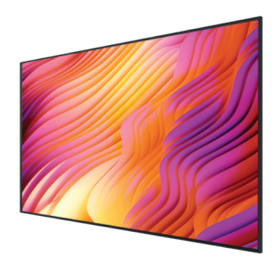
Specification subject to change | Sept 2023