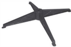
STEP 2 (Figure C)