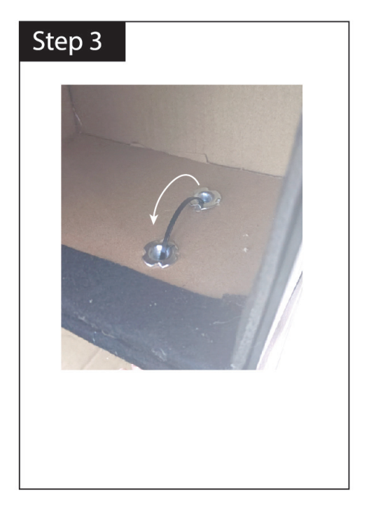
Step 3- Thread the zip tie through the hole in the top section to the hole in the bottom section. Repeat the same step on the left side.