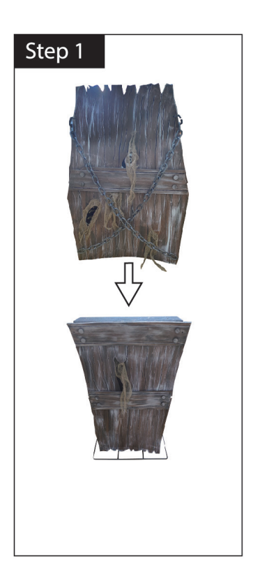
Step 1 - Put the Top section on the bottom section of the coffin together.