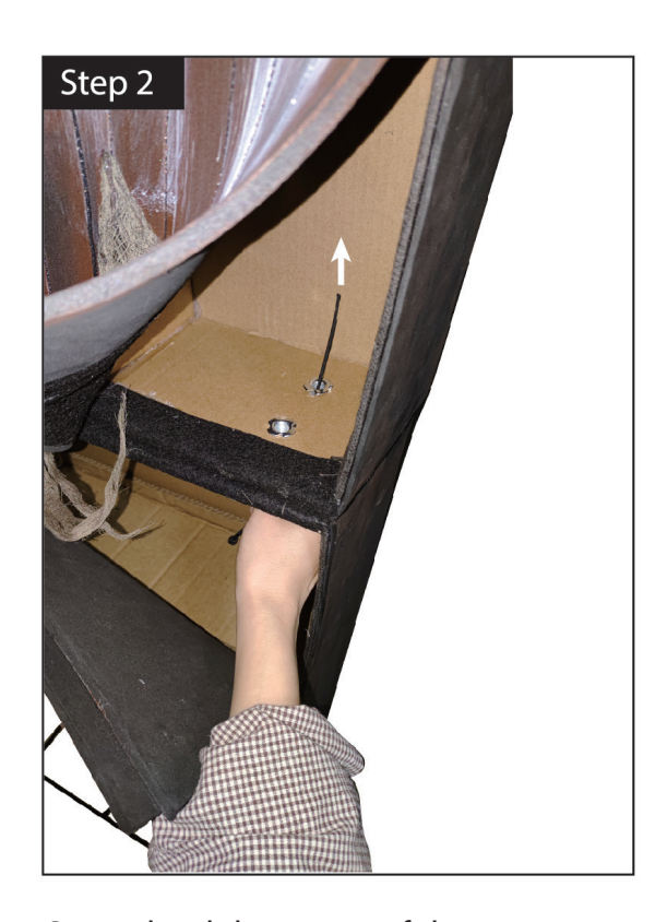
Step 2- Open the right corner of the two sections of the lid. Thread the longer zip tie through the holes in the bottom section to the holes in the top section. Repeat the same step on the left side.