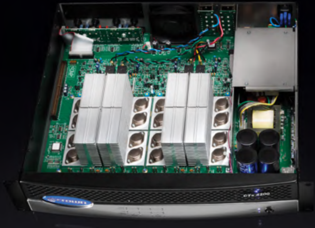
CTs 4200 | 4X250W