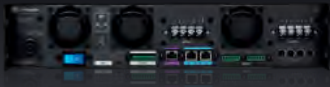
4|2400 Network Back Panel

D - Process Dante audio signals through the Soundweb London BLU-806, BLU-326, or BLU-DAN via BLU link into any DCi Network amplifier.