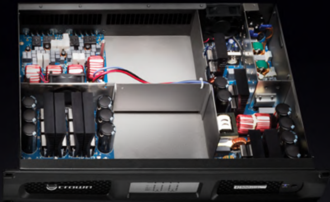
DCi 4|600 | 4X600W

A DCi 4|600 delivers more than twice the power while using just half the space of a CTs 4200 - with almost half the current draw - and drives 100Vrms lines at 600W.