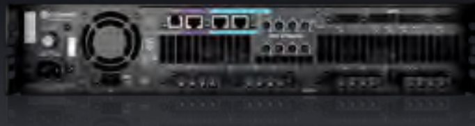
Network Back Panel