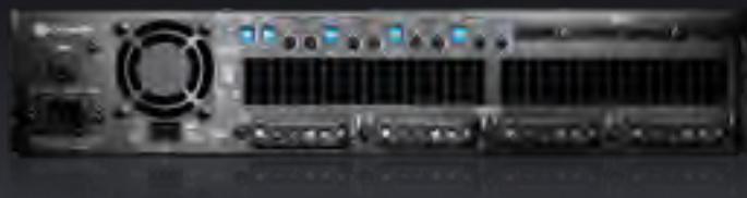
Analog Back Panel