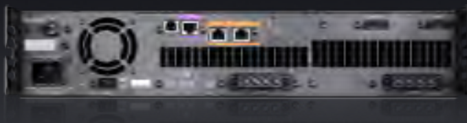
Network Display Back Panel