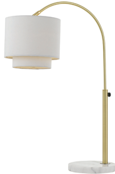
HLOUISEGLD-1TBL Pale Gold Table Lamp