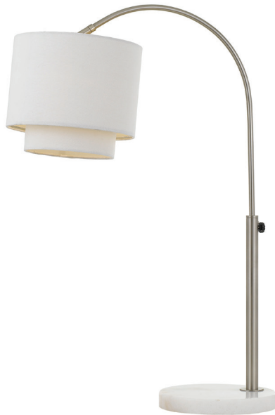
HLOUISECHR-1TBL Brushed Chrome Table Lamp