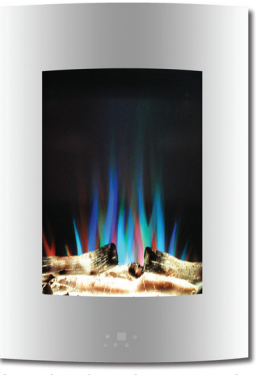
White (WT) with Log Display