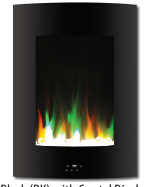
Black (BK) with Crystal Display