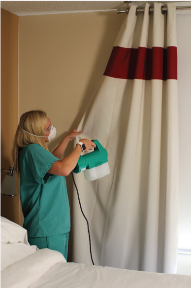
Front of curtains from top to bottom