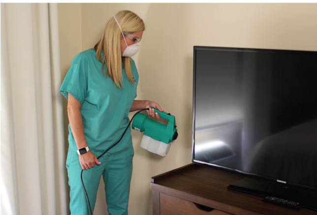
Behind all furniture