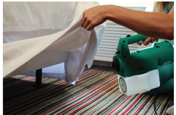
Under the bed