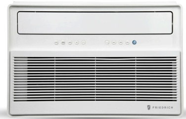
WINDOW OR THRU-WALL INSTALLATION CCV15, CCV18, CCV24