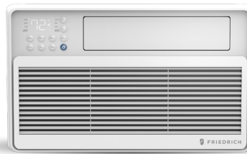
WINDOW INSTALLATION ONLY CCV08, CCV10, CCV12