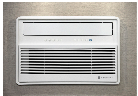
Models CCV15, CCV18, CCV24 can be installed in a wall or window