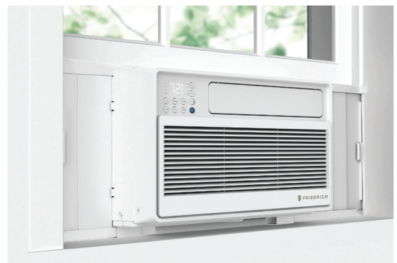
Rigid, Expandable Side Panels