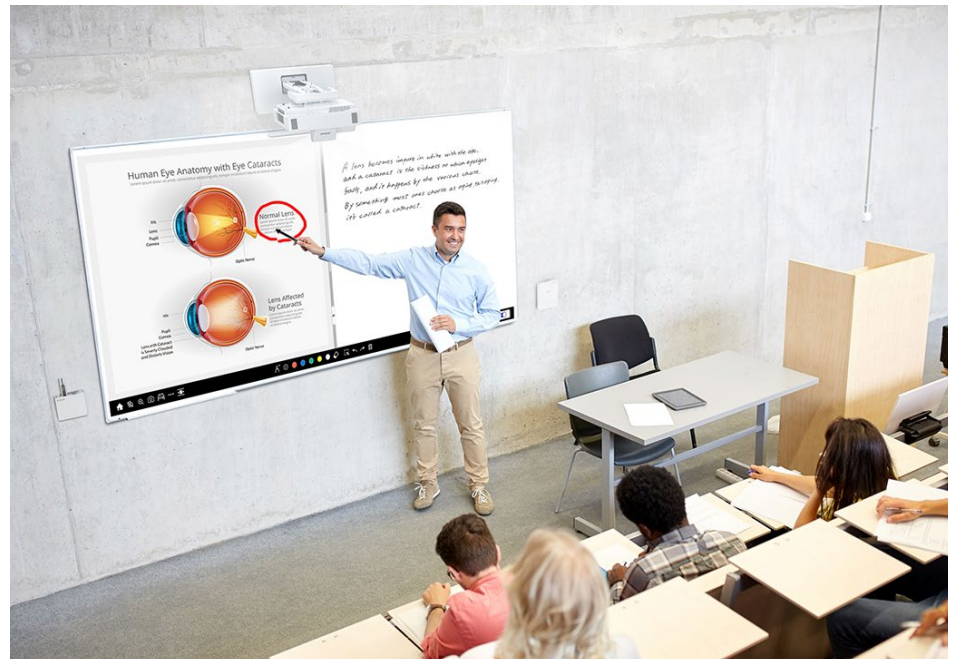
All projected images simulated.

Epson<sup>®</sup> PowerLite lamp-free laser displays are laser focused on education. With select models offering a larger-than-life image size up to 16x larger than 75" flat panel displays*, these innovative laser displays make it easy to share bright, eye-catching images that keep students engaged from nearly anywhere in the room. And, they support convenient sharing and collaboration with built-in wireless and Miracast<sup>®**</sup>.