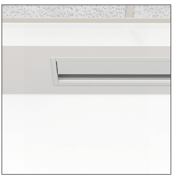
In Ceiling (Closed)