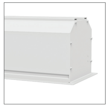
Case Profile - Sizes Over 14' W