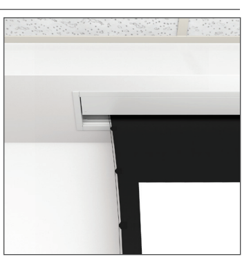
In Ceiling (Open)