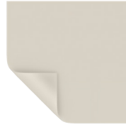
Ultra Wide Angle