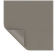
High Contrast Da-Tex