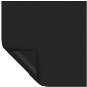
3D Virtual Black