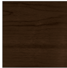
Heritage Walnut Veneer