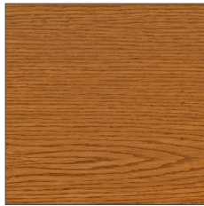
Medium Oak Veneer