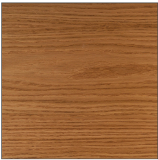
Light Oak Veneer