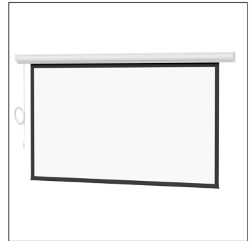
Integrated IR Remote (includes 10' power cord)