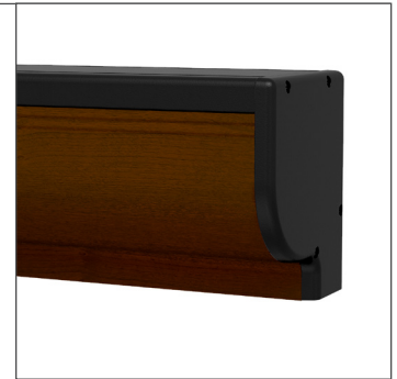
Dark Veneer Case