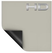
HD Progressive 0.6 Half Angle: 85° Gain: 0.6