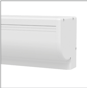
White Case (Standard)