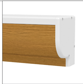
Light Veneer Case