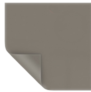
Da-Tex Half Angle: 30° Gain: 1.3