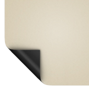
Cinema Vision Half Angle: 45° Gain: 1.3