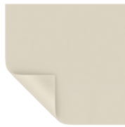
Dual Vision Half Angle: 65° Gain: 0.9