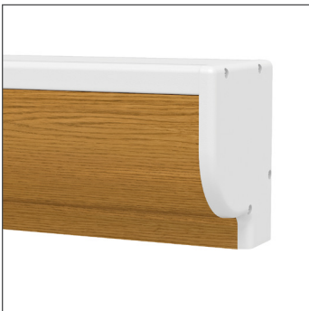
Light Veneer Case