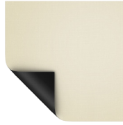
Video Spectra 1.5