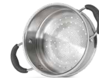
18 cm Universal Steamer Insert

Cook several dishes at once, in portions large and small, with this versatile 11-piece set.