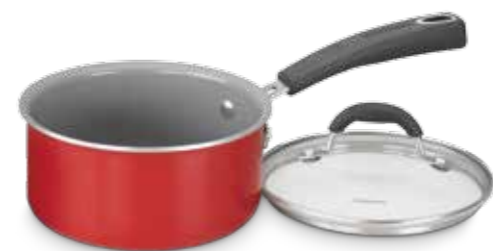
1.5 Qt. Saucepan with cover