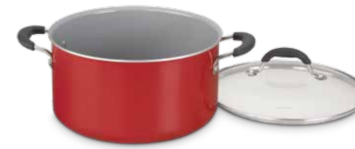
6 Qt. Stockpot with cover