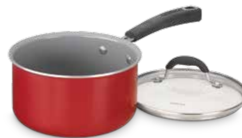
2.5 Qt. Saucepan with cover