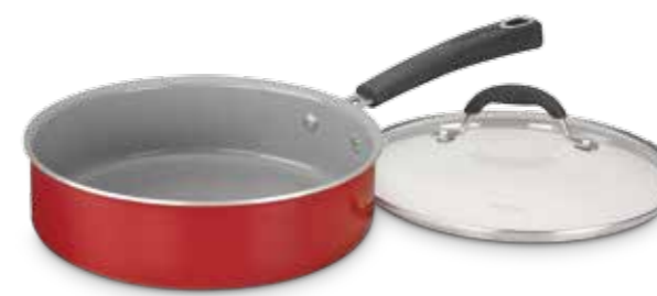
3 Qt. Sauté Pan with cover