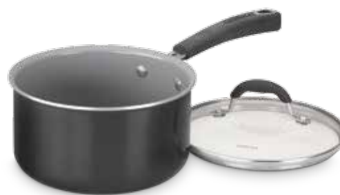
2.5 Qt. Saucepan with cover