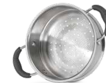
18 cm Universal Steamer Insert

Cook several dishes at once, in portions large and small, with this versatile 11-piece set.