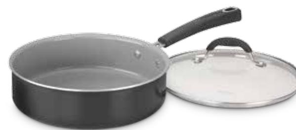
3 Qt. Sauté Pan with cover