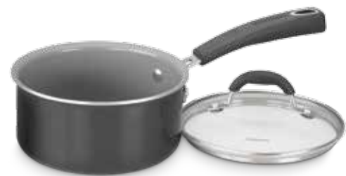
1.5 Qt. Saucepan with cover