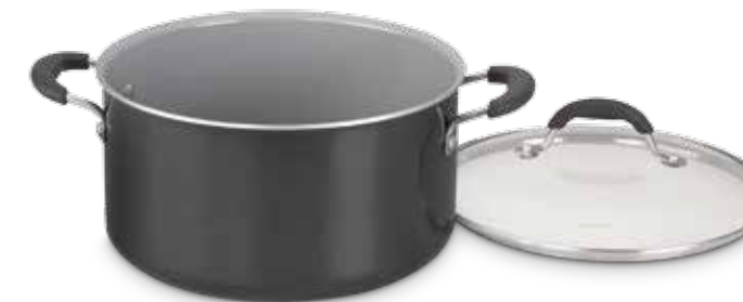
6 Qt. Stockpot with cover