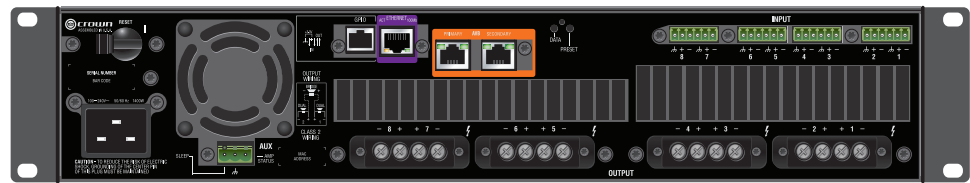
8 channel model with C14 mains socket shown