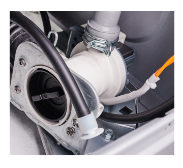
EASY ACCESS REPAIR PANEL

Eliminate error with intuitive controls and wash options.