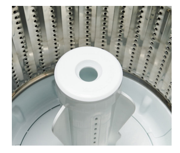
PRO GRADE OUTER TUB

90% serviceability from the front of the machine.