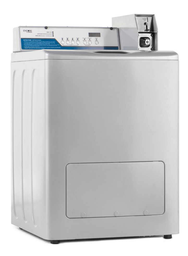
* shown with coin box