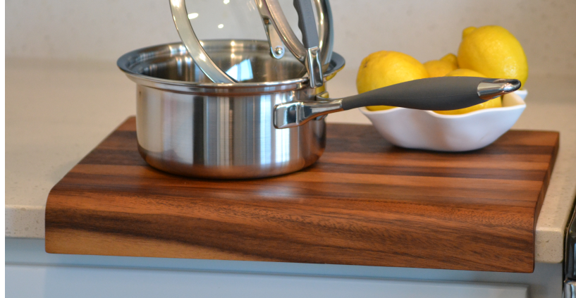
Over-the-edge cutting board fits over any size countertop for easy distribution of food and the high quality that CookCraft is known for.