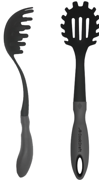
Pasta Server ●