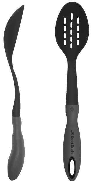
Slotted Spoon ●