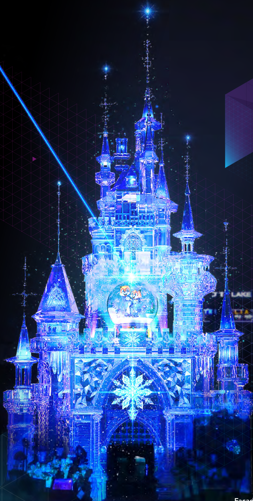
Façade projection mapping