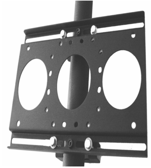
Figure 2. TPK-2 Pole Mount Example