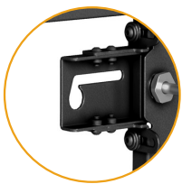
KEYHOLE MOUNTING SLOTS