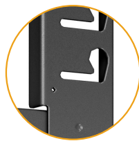
OFFSET DISPLAY MOUNTING SLOTS