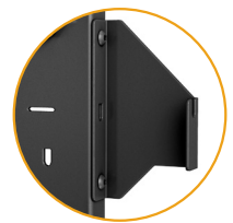
MODULAR SYSTEM DESIGN