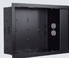
PAC525, PAC526 & PAC527 In-Wall Storage Boxes