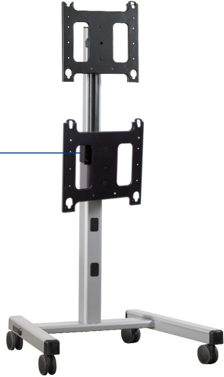
MFCU with MAC720 (vertical configuration)