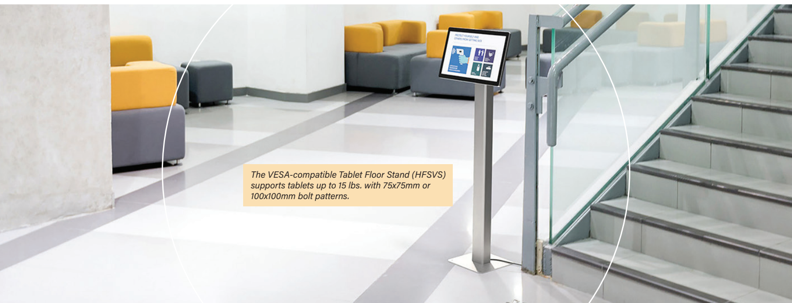
The VESA-compatible Tablet Floor Stand (HFSVS) supports tablets up to 15 lbs. with 75x75mm or 100x100mm bolt patterns.