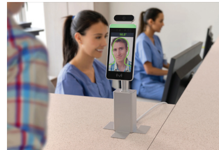
The Tablet Tabletop Stand (HTSTS) supports temperature-sensing, column-mounted tablets up to 10 lbs.

Chief floor and tabletop tablet stands support safe entry and navigation through public spaces. By offering aesthetic, value-driven, easy to install mounting solutions, Chief is simplifying the overwhelming complexity of health protocol solutions in the marketplace. When paired with a temperature-screening device, these mounts serve as a complete solution in providing peace of mind for individuals as they enter a business, workplace, school or any public space. Fostering confidence and safety, Chief tablet stands help secure access for everyone's return to spaces where we live, work and play.