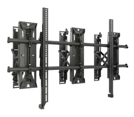
FCAXV1U mount sold separately