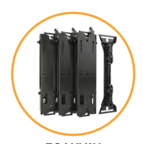
FCAXV1U 3x scissor arm assemblies, 1x wall plate & hardware