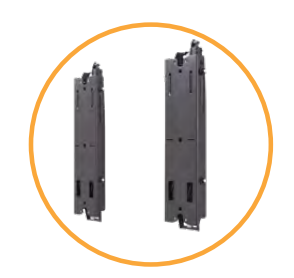
FCAV1U 2x scissor arm assemblies & hardware