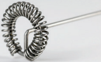
Milk frother with stainless steel spring