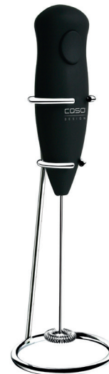
Elegant stainless steel stand