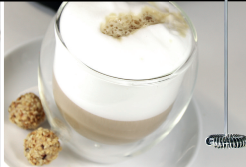
Ideal for latte macchiato