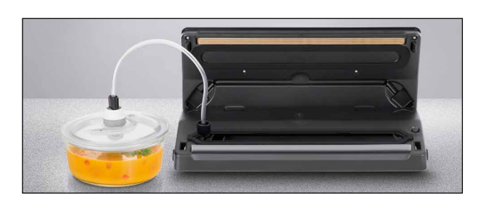
INCL. VACUUM CANISTER FUNCTION