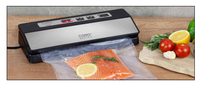
FULLY AUTOMATIC VACUUM SYSTEM Ideal for meat, fish, vegetables and fruit