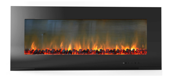
Black Bezel & Log Display CAM56WMEF-2BLK