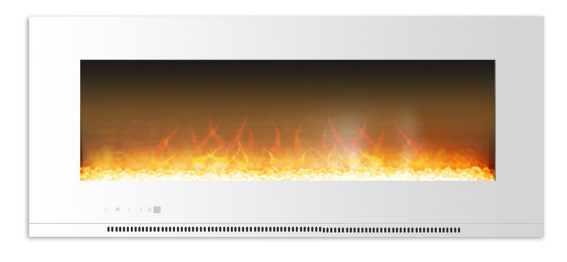
White Bezel & Crystal Rock Display CAM56WMEF-1WHT