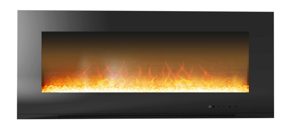
Black Bezel & Crystal Rock Display CAM56WMEF-1BLK

The flames can operate with or without heat, which makes it perfect for warmer seasons and year-round use. A convenient remote control is included so you can easily adjust the settings from anywhere in the room. Its tempered-glass screen and low-profile frame add a modern design that can easily integrate with existing wall art. Simply turn it on and enjoy the serene, warm effect that it adds to your home.