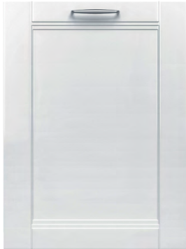
SHV9PCM3N Custom Panel

PowerControl™ spray arm targets your dirtiest dishes with a deeper clean, no matter where you load them on the bottom rack.