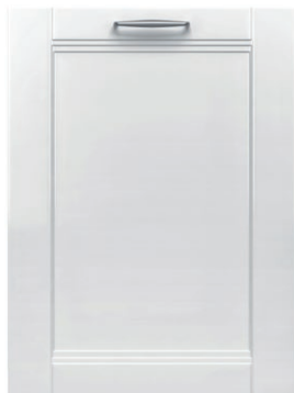
SHV53CM3N Custom Panel

The 3rd rack provides the perfect space for silverware and large utensils while its V shape leaves room below for taller items.