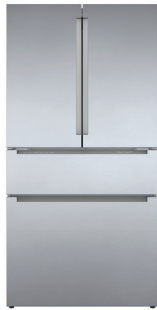
4 Door Stainless Steel Recessed Handle B36CL80ENS