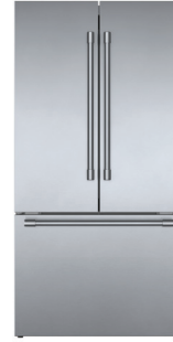
3 Door Stainless Steel PRO Handle B36CT81SNS