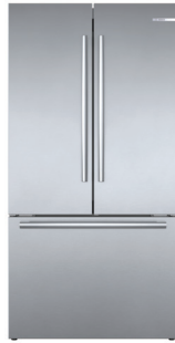
3 Door Stainless Steel Bar Handle B36CT80SNS