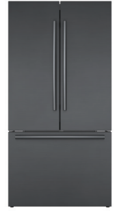
3 Door Black Stainless Steel Bar Handle B36CT80SNB