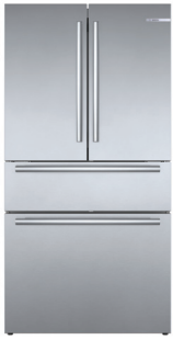
4 Door Stainless Steel Bar Handle B36CL80SNS