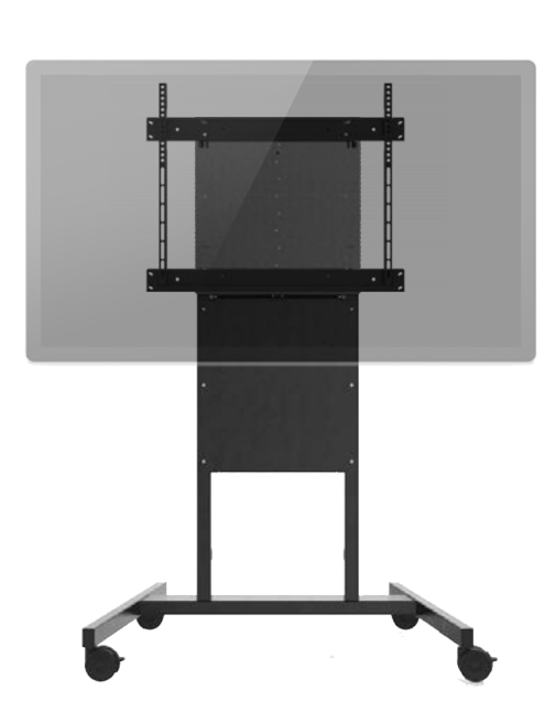
D-FLEX400-CART with VESA bracket