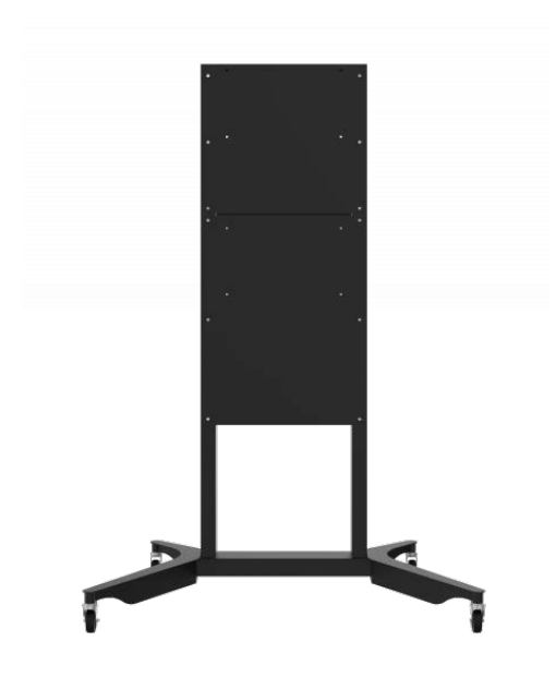
D-FLEX-CART no VESA bracket