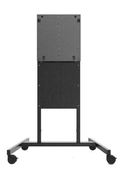
D-FLEX400-CART with DynamiQ 400 adjustable Mount