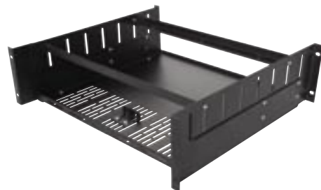
SH Series Shelves

*Some options may be series specific and not available for all models.