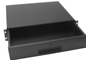
SD Series Drawers