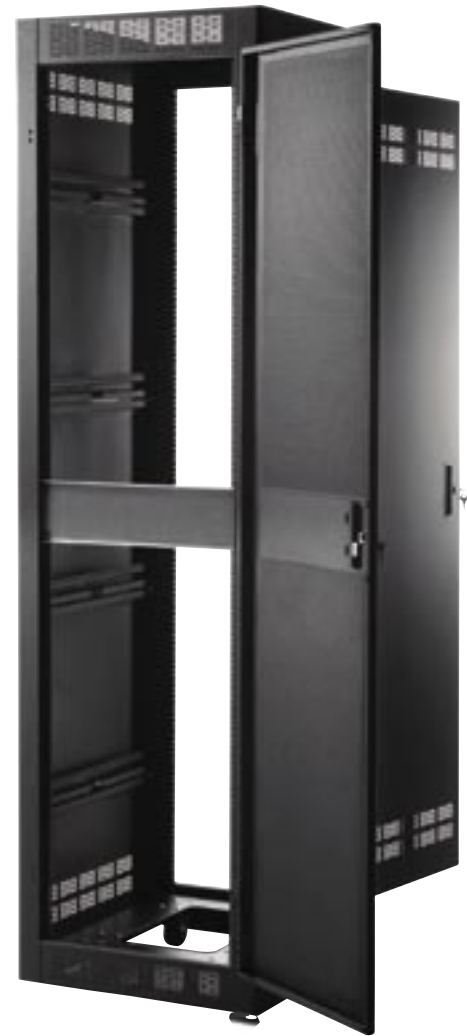
FMA44-25SA (Shown with Optional Front Door & Side Panels)

The Atlas Sound FMA (Folded Metal Assembly) design incorporates an innovative "Radius" look characterized by sleek corners and seamless joints. This look blends effortlessly in today's ergonomically designed office environment. A wider footprint of over 24" offers installers the luxury of more available working space, particularly valuable in wire management applications where space is often inherently limited.