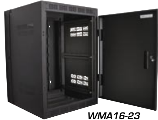
WMA16-23 (Shown with optional SFD16 Solid Front Door)