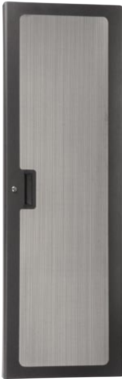
MPFD Series Doors