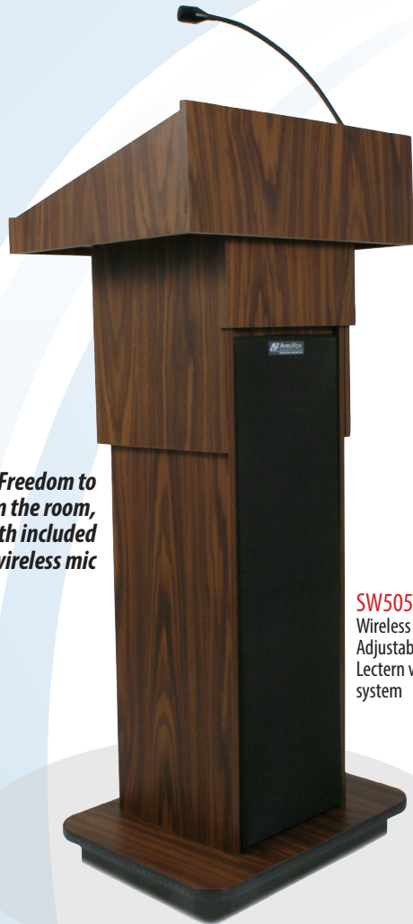
SW505A Wireless Executive Adjustable Height Lectern with sound system

Freedom to roam the room, with included wireless mic