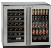
STAINLESS FRAME (LOCK)