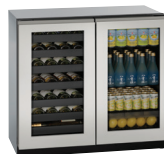
STAINLESS FRAME (HANDLELESS PANEL)*