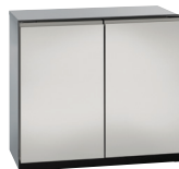
STAINLESS SOLID (HANDLELESS PANEL)*