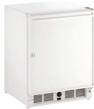
WHITE SOLID (LOCK)