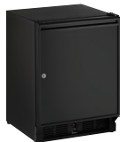
BLACK SOLID (LOCK)