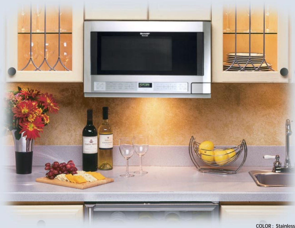
COLOR : Stainless Steel