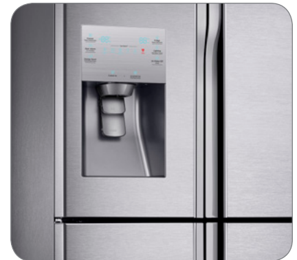
Clean, Modern Design