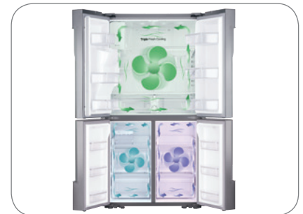
Triple Cooling System