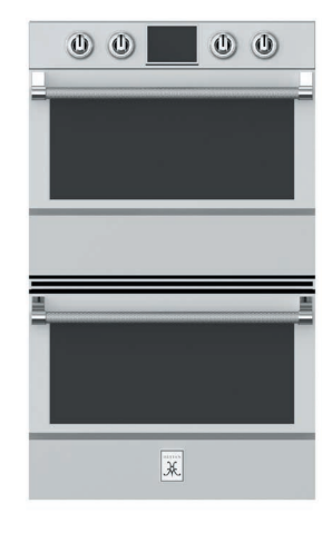
30" Double Wall Oven