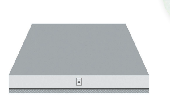
36" Chimney Hood Also in 30", 42", 48" and 54" widths