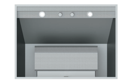
36" Liner Hood Also in 30", 42", 48" and 54" widths

Cooking tends to leave behind a joyous mess. Hestan happily (and silently) handles it. Hestan hoods clear the air of even the most intense cooking odors with best-in-class ventilation while safely collecting 70% more grease than most competitors. The dishwasher cleans everything from stock pots to stemware quietly, carefully and thoroughly with its patented Double Axial Washing System™. Then the automatic door pops open to maximize airflow and conserve energy for spot-free drying. It's the next best thing to a magic wand.