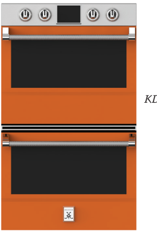
Model Numbers as shown KSO30