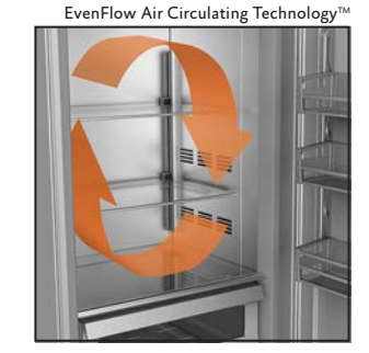
Adjustable Shelf System